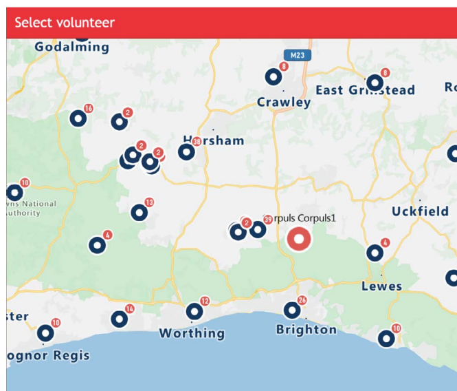
Map of volunteers in your area

You'll see a map of volunteers in your area. Click one. The Circuit will ask if you're sure you want to add the person as a Support Guardian, click yes, and they will receive a request to act as a Supporting Guardian. You can ask for help anytime.